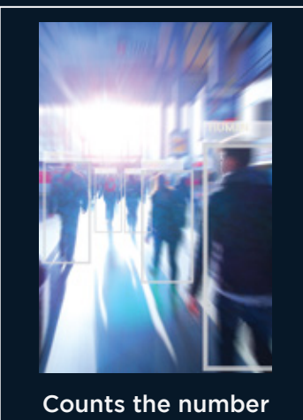
Counts the number of people in the scene